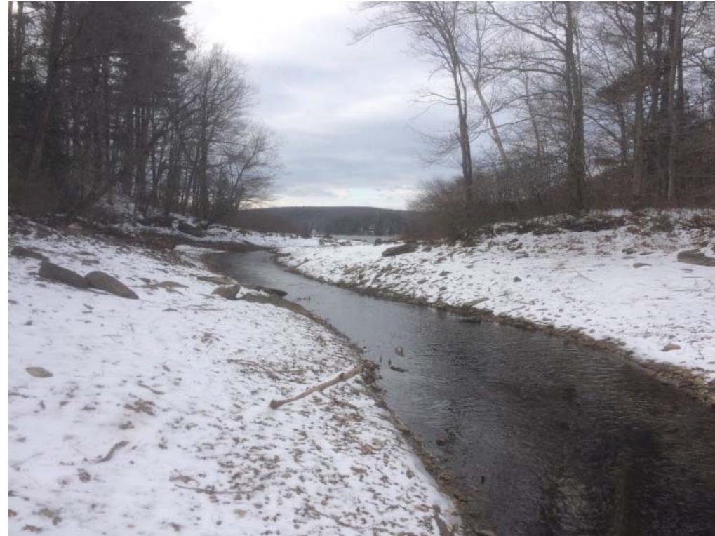
Connection between Upper Goose Pond and Lower Goose Pond during drawdown, Winter 2015