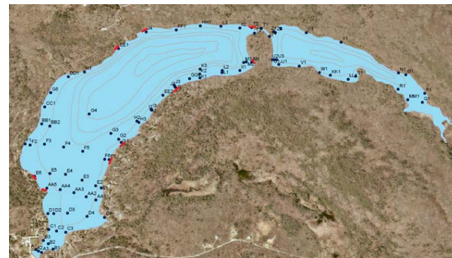
Phragmites Distribution in 2015