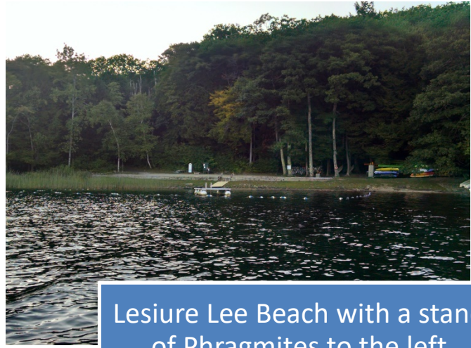
Lesiure Lee Beach with a stand of Phragmites to the left

Initially, herbicide treatments in Goose Pond were planned for the 2017 growing season. However, there were numerous comments and concerns brought to the attention of the District regarding the increase weed nuisance in Goose Pond. With the necessary permits now in place, the District reached out to WRS to prepare a current survey and study of the phragmites and milfoil in the pond. It was determined that the invasive species had spread from the study prepared just a year ago.