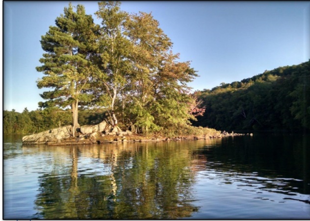
Island In Upper Goose Pond, September 2016