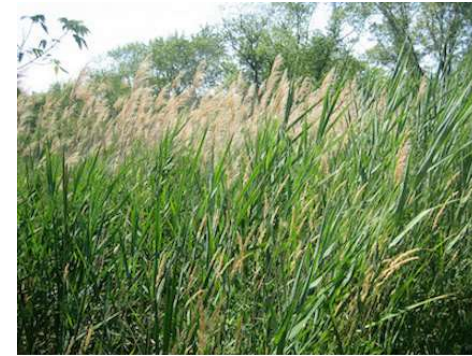
Common Reed ( Phragmites australis )

In the fall of 2019, the District contracted with SOLitude Lake Management to provide treatment of the previously mapped phragmites. This treatment would be like the previous treatment, a spray application from a boat, targeting areas that were surveyed by an independent survey. Once the invasive beings to die, it can be removed from the shoreline. It can be cut and burned or bagged and removed from the site. The area can also be covered in mats as done in past years. All methods to remove the plant must be done by hand, no mechanical means are permitted.